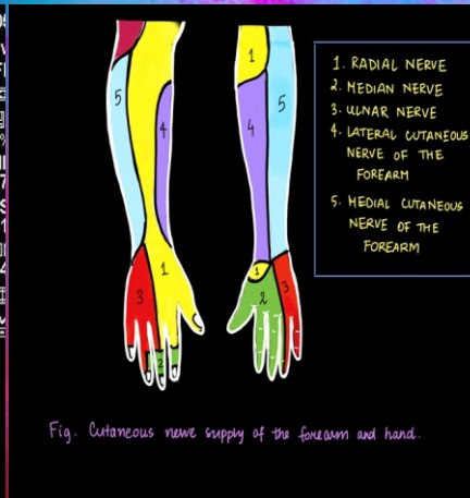
Fig. Cutaneous nerve supply of the forearm and hand.